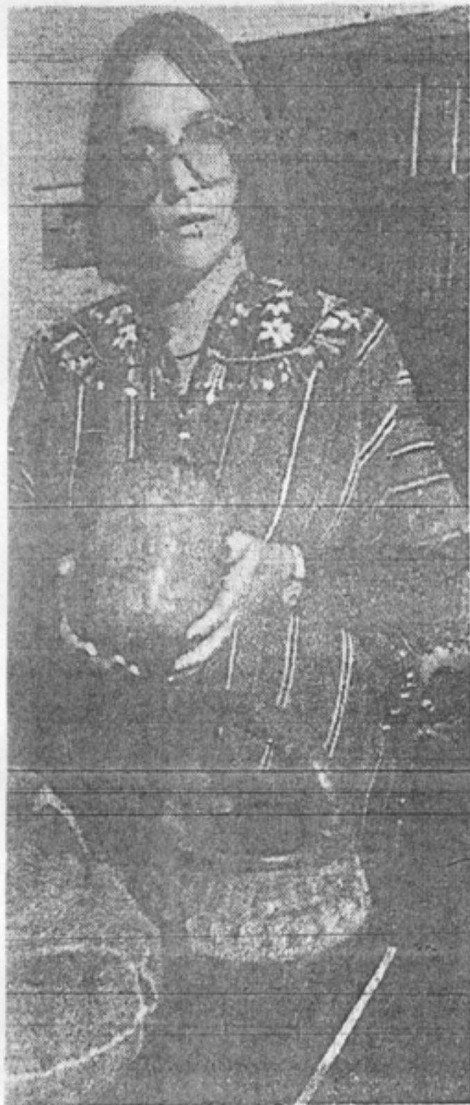
ruhns holds a recovered Mayan vase.

The rapist has been described as being 25 to 35 years of age, white, between 5 feet 8 inches and 6 feet tall, clean shaven, with dark, neatly cut