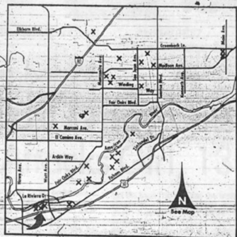
Crosses mark the sites of the East Area rapist's attacks.

...will stay in close touch with the... ...conference committees because, "I... ...consider this to be my overriding... ...responsibility at this time."